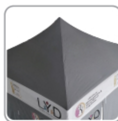
Exclusive seamless Rooftop and walls featuring no joins